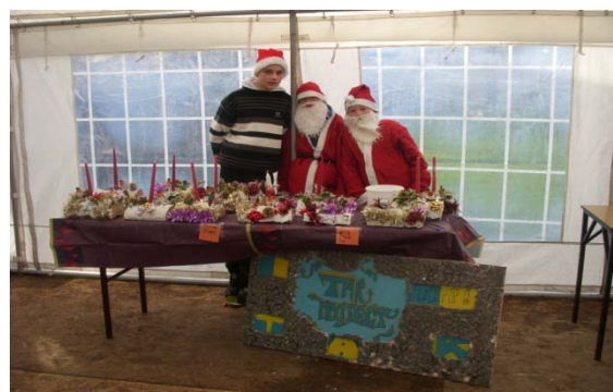
Volunteer Awards and AGM