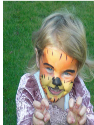
the adoring TRYS staff!!)

Friday night marked the official launch of the YIIPPE Festival in the Market Yard following a parade through the town by local groups and clubs, led by the CJ Kickham Brass Band. The Wobbly Circus were on hand to entertain with a fiery display and stilt walking.